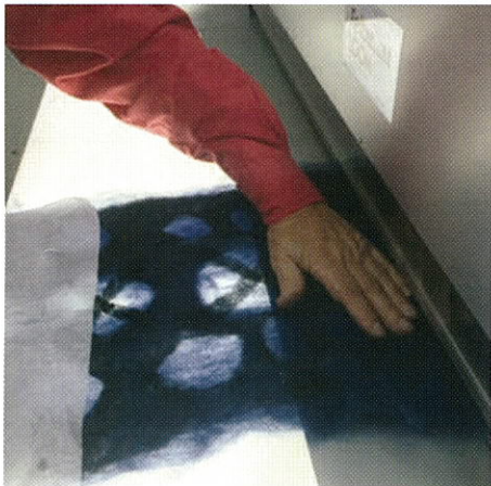
FeltLOOM in use